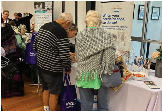
Senior Lifestyle Expo - Caboolture