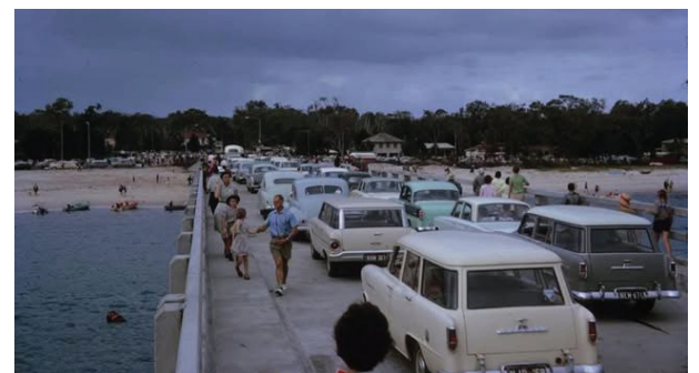
Bridge Opening 19 Oct 1963